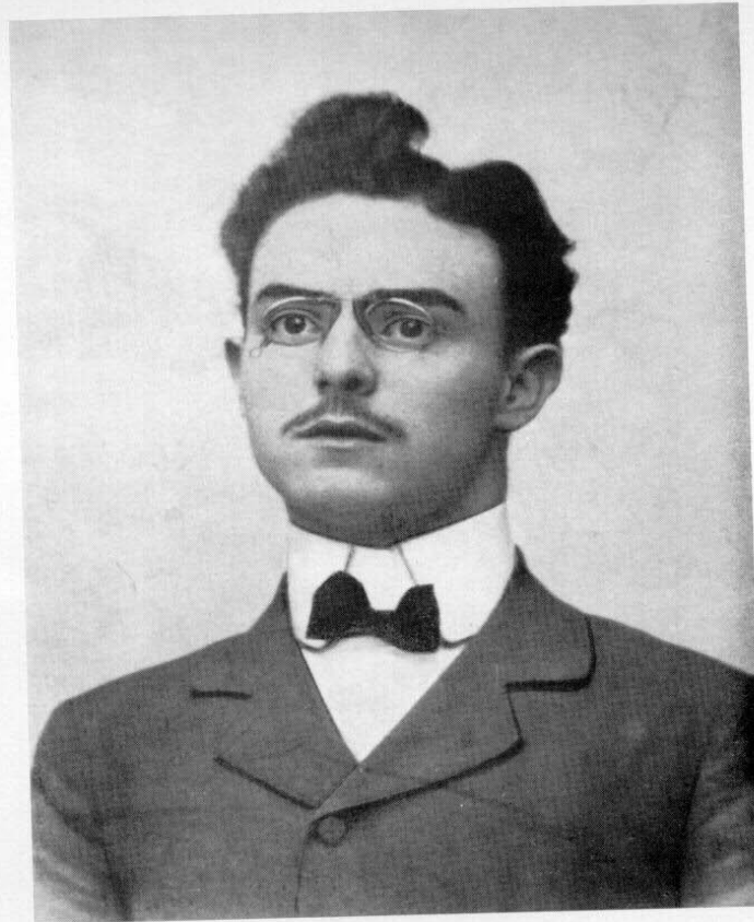
Mauro Picone a 18 anni (nel 1903).