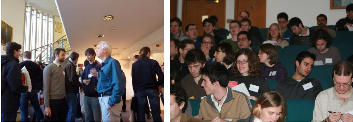
Figure 1: Left: registration before the first talk. Right: audience awaiting the talk by Ian Stewart.