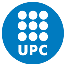
Universitat Politècnica de Catalunya (UPC)