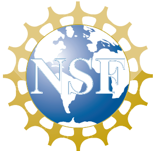
National Science Foundation (NSF)